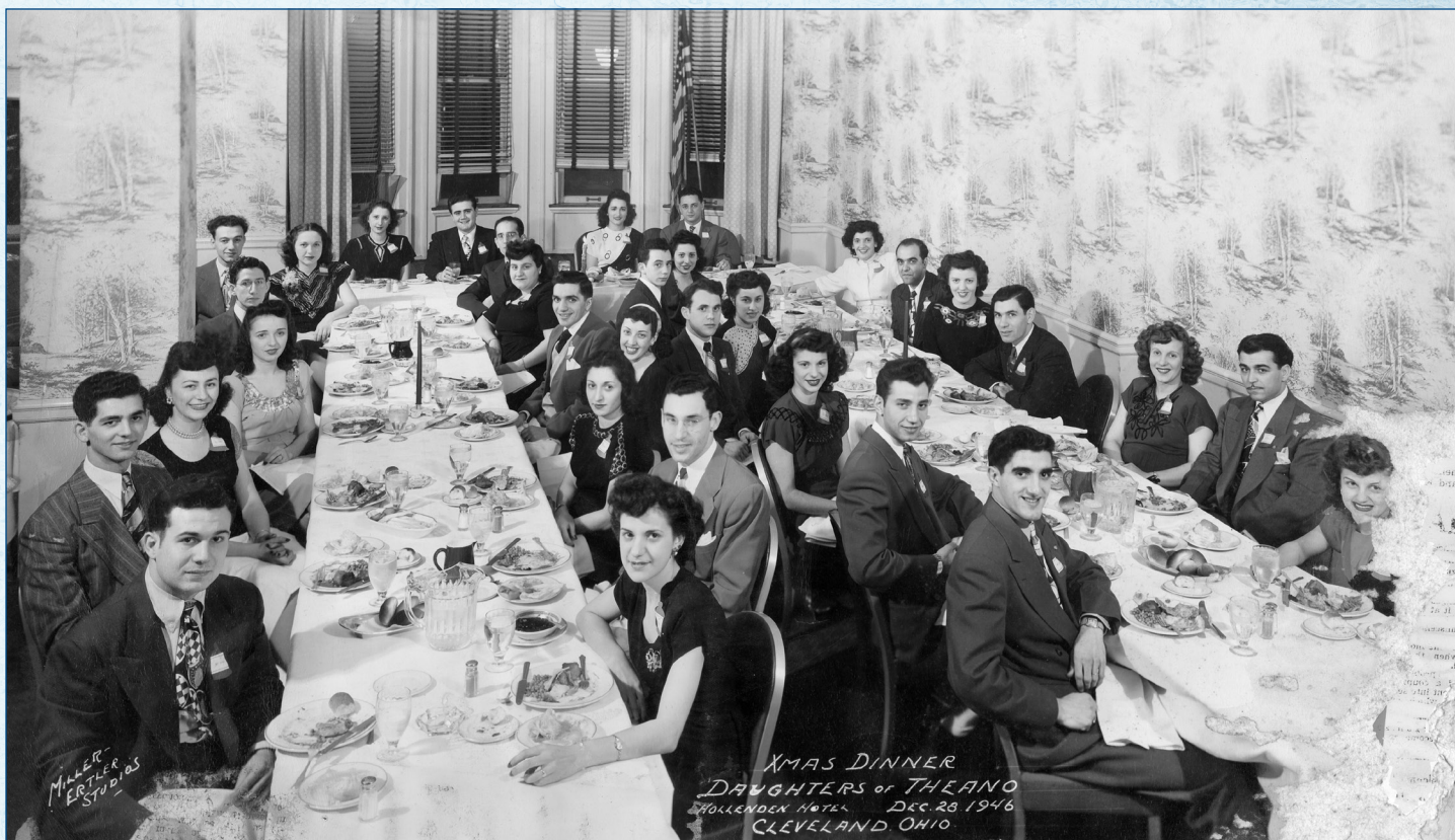
The Daughters of Theano was a popular Samian (from Samos) women's club. This photo was taken at a holiday dinner at the Hollenden Hotel in Cleveland, Ohio on December 28, 1946.